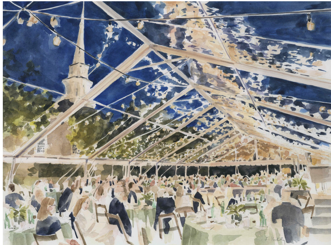
watercolor by Susan Woodard Kelly

On April 28th of 2023, 400 people gathered Under the Stars—and a clear top tent—for a fun-filled celebration of all that God has done through the establishment of the Foundation by the congregation on May 17, 1998 and its subsequent implementation.